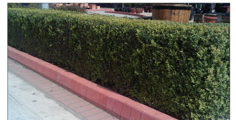
Create a nice formal boundary with box ( Buxus ) hedging.