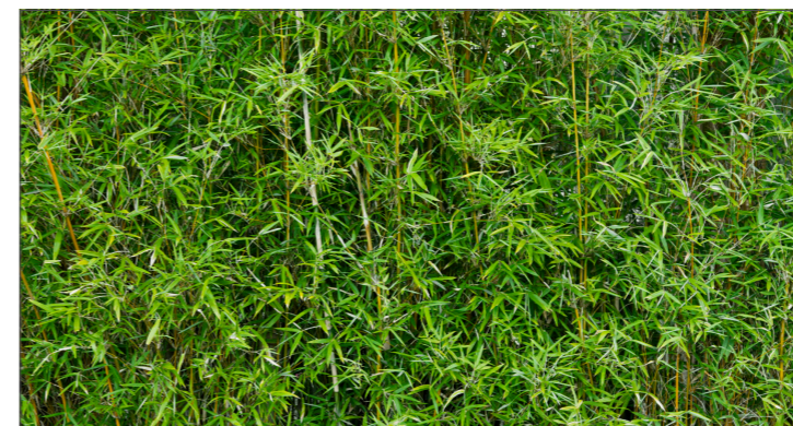
Bamboo is a fast growing hedge.