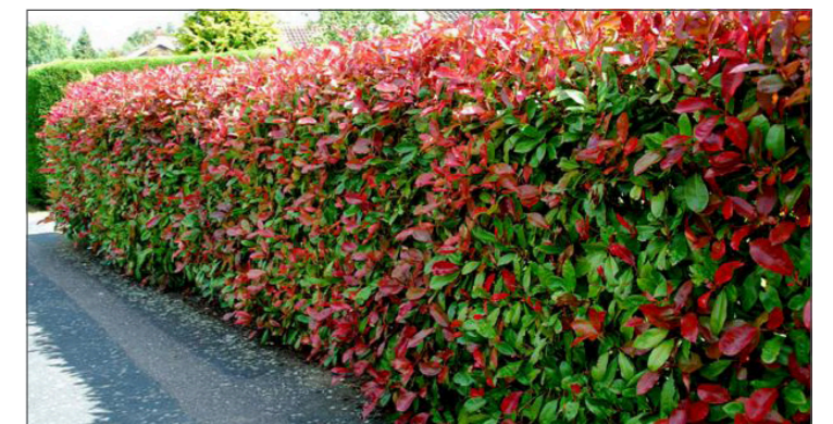
Choose Photinia for colourful foliage.