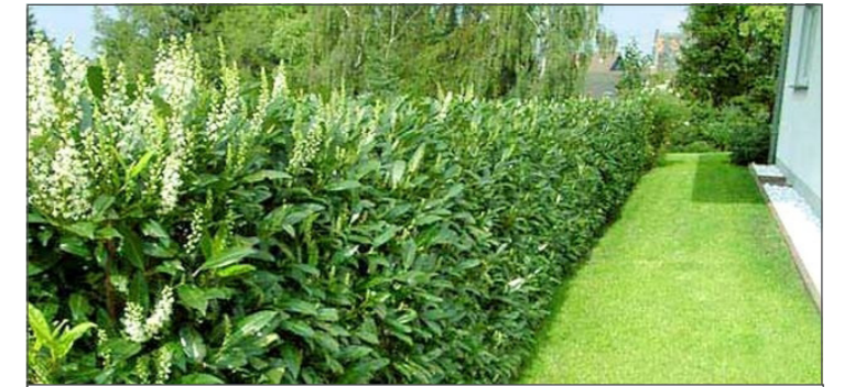
Laurel is a very popular evergreen hedge ( Prunus ).