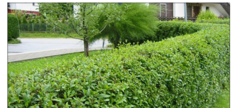
Privet ( Ligustrum ) is good and hardy.