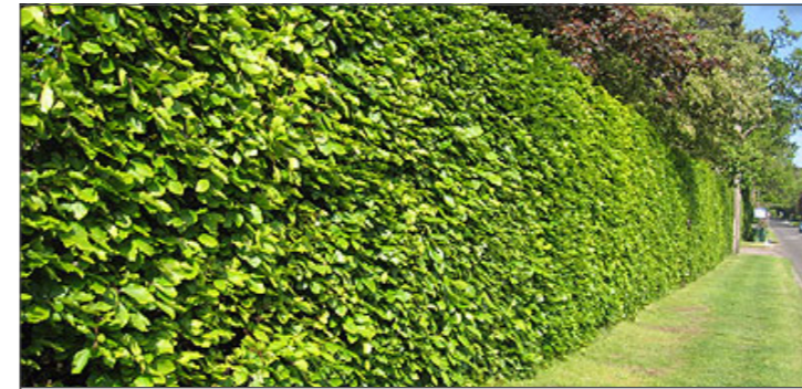
Choose a low maintenance green Beech ( Fagus ) hedge.