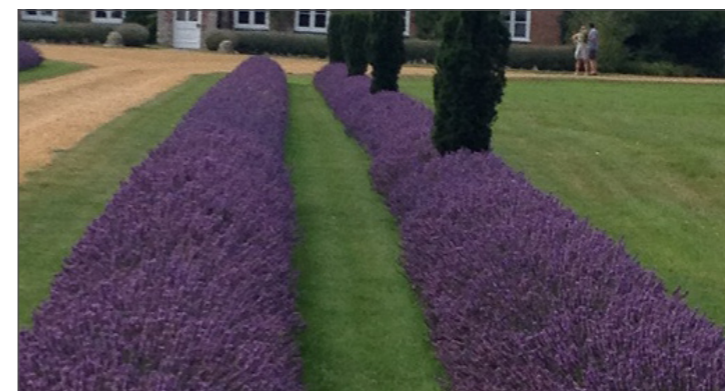
Lavender ( Lavendula ) makes a nice informal scented hedge.